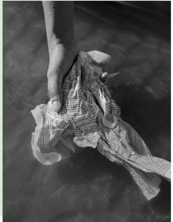
Self Abridged Passages, 2021.