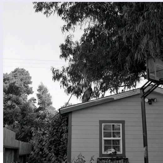
Siempre hay algo que hacer , 2020.