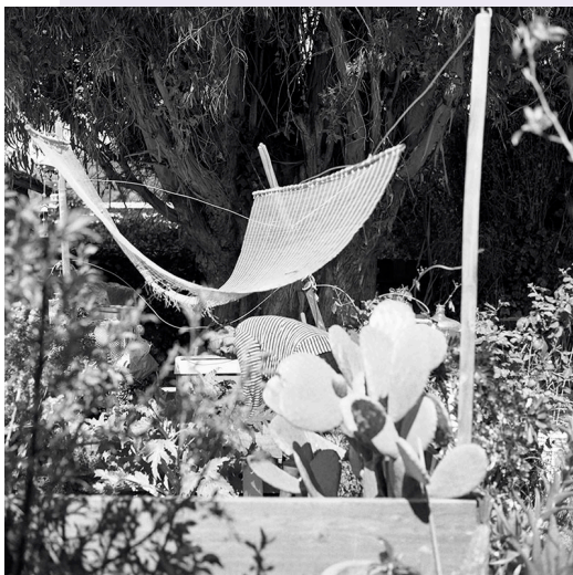
En su jardín , 2020.