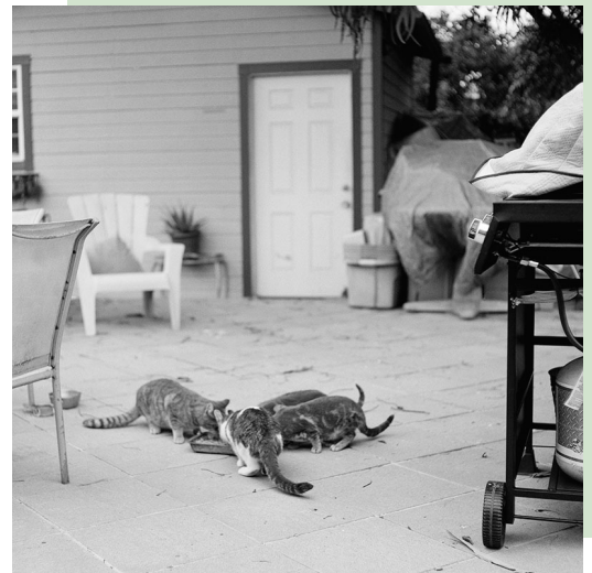
Top to Bottom: Tamales , 2019; Mami's strays , 2019.