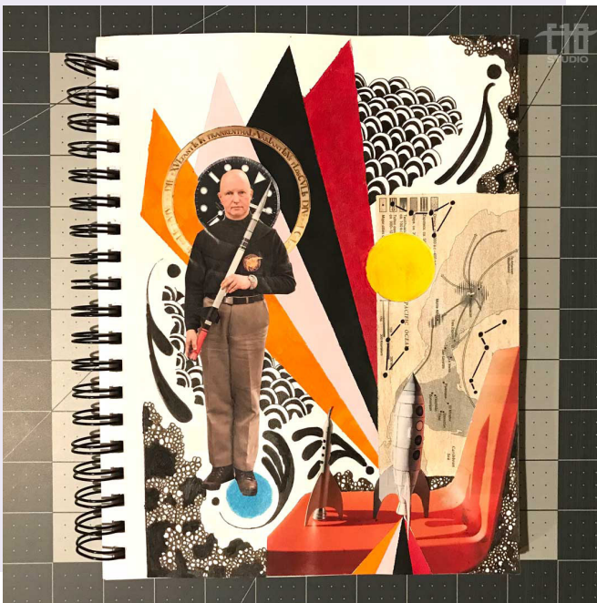
One Big Leap