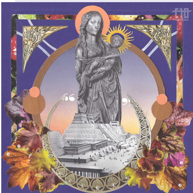
Sunday , 2019.