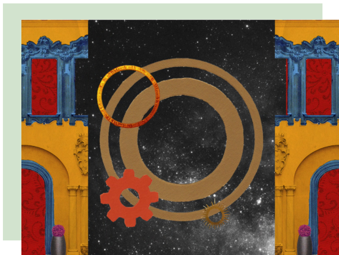
Still from Overture .

My thesis is a collection of work exploring fantastical scenes and landscapes in an imaginary world. These scenes are dream-like in nature and they are very materially-driven. I love drawing and I love getting hands-on in the studio. These images can end up getting pretty bizarre and immersive simply because there's so many ways to combine media and materials. I'm working towards creating a cohesive visual experience. I want people to feel immersed in my work as they navigate through my illustrations. It's really fun combining sci-fi and fantasy along with a lot of my historical influences!