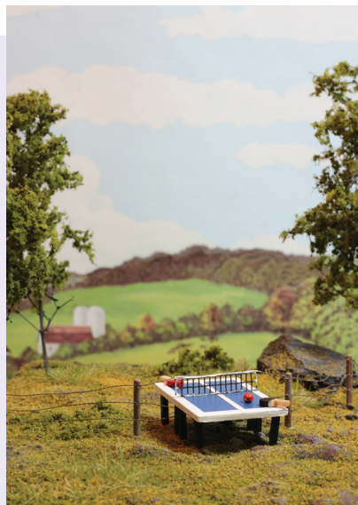
Left: Go Get the Ball Adam! , 2021. 12" x 8" x 8", foam, plaster, rocks, flock, styrene, basswood, cloth, ball bearing, acrylic, wire