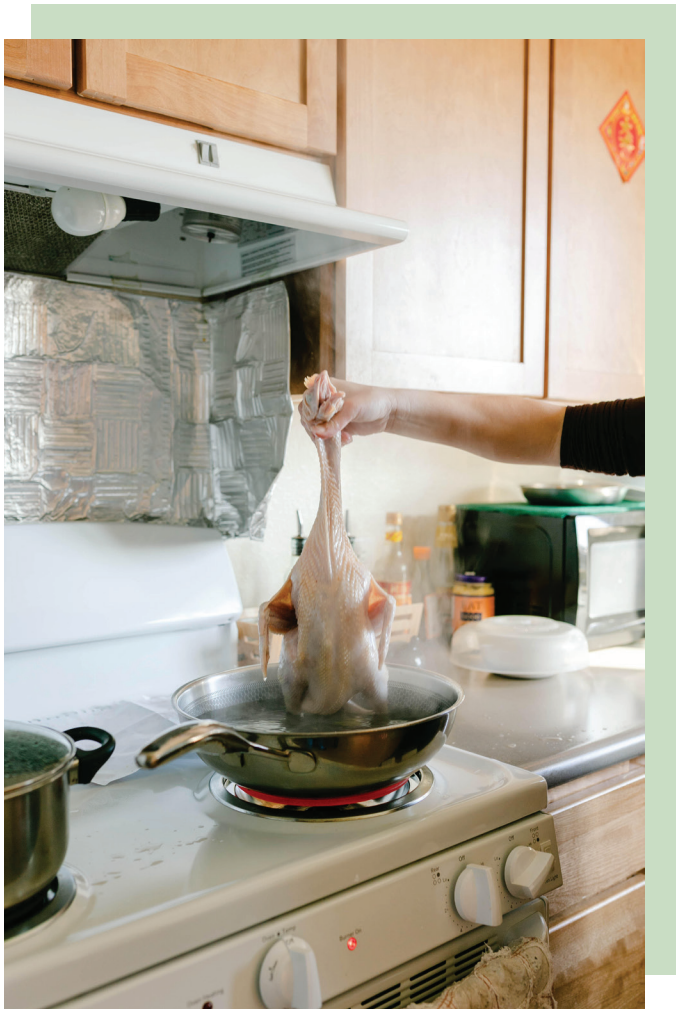
Bak Chit Gai #4, 2021.