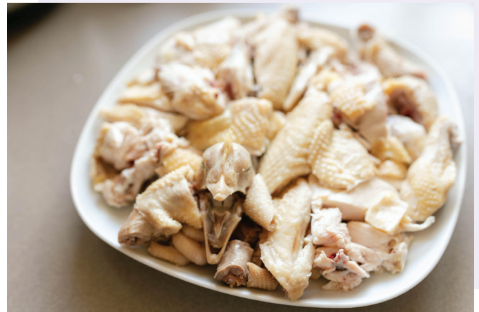
Bak Chit Gai #18, 2021.