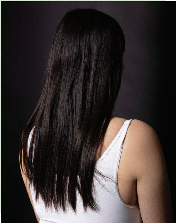
Untitled (Mom's Hair), 2020.