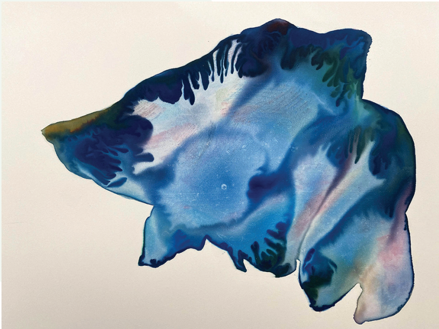
Squeeze 7, 2020. Monotype.