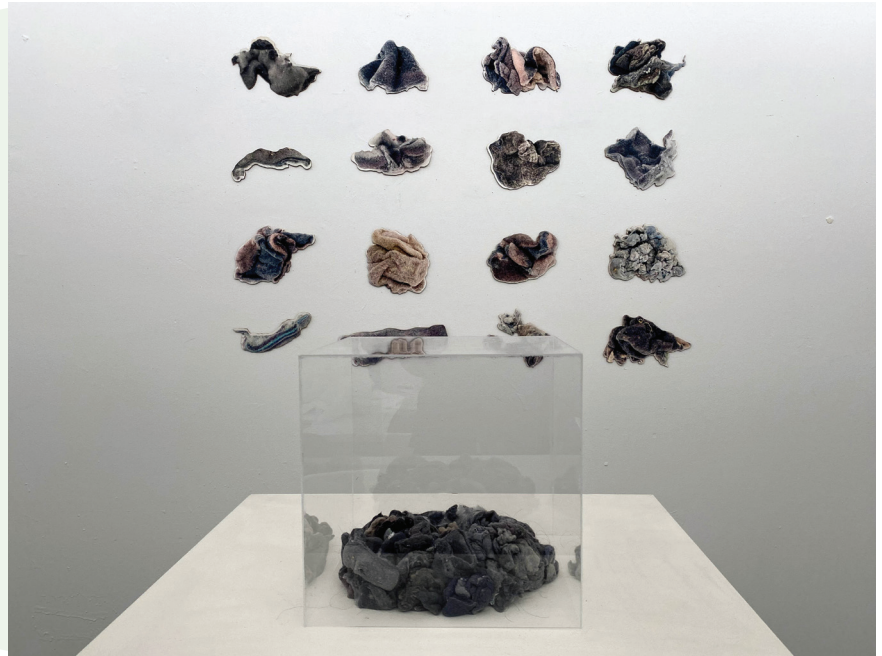
Sequeeze , 2019. Lint, photographs.

After that, Sun started to collect the lint, first bringing it together into an installation piece. In the second phase of this series, instead of putting all the pieces of lint together, she attached each one to a plywood base that maintained its shape.