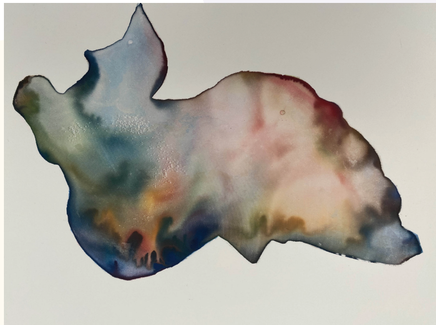
Squeeze 8, 2020. Monotype.