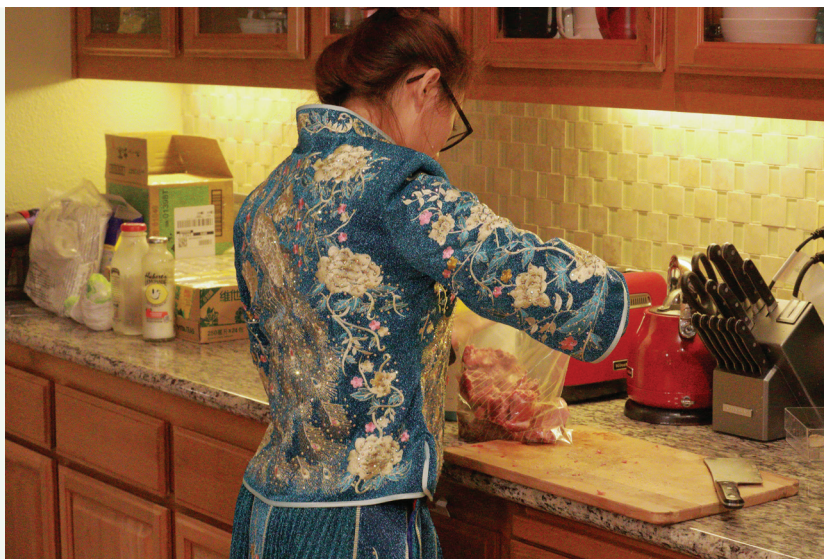
Housework, Ongoing. Performance.