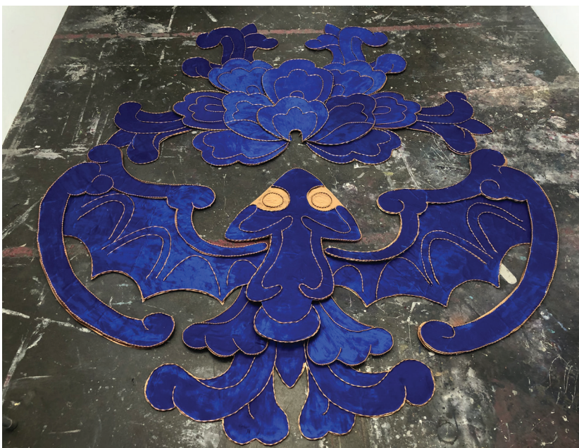
Escape, 2019. Copper, wedding dress.

Chinese women, she kept asking this question as she considered what she wanted to represent their suffering in different periods. One of her artworks, The Bed , incorporates an ancient Chinese language called Nvshu — the only script worldwide designed and used exclusively by women to communicate with each other, having been denied the ability to read and write. In another work, she incorporated the leftover candles that her husband had used when he proposed. She cast the shape of her own foot in the candle wax and squeezed the result into the distorted form created by foot binding, which women suffered for centuries in China to modify their feet into a specific shape and size.