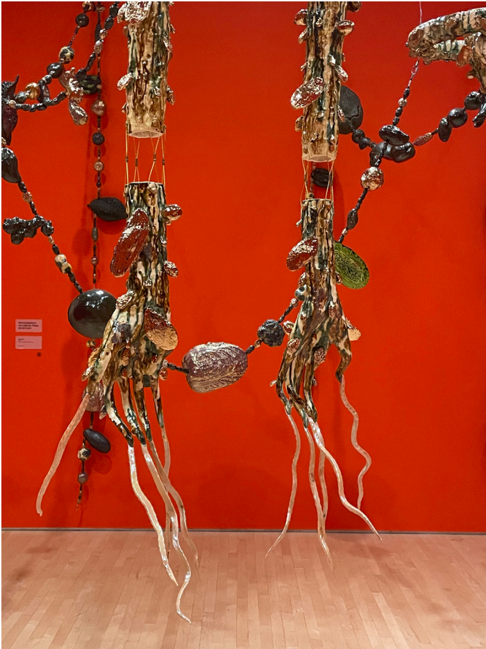
Cathy Lu, Resurgence , 2022