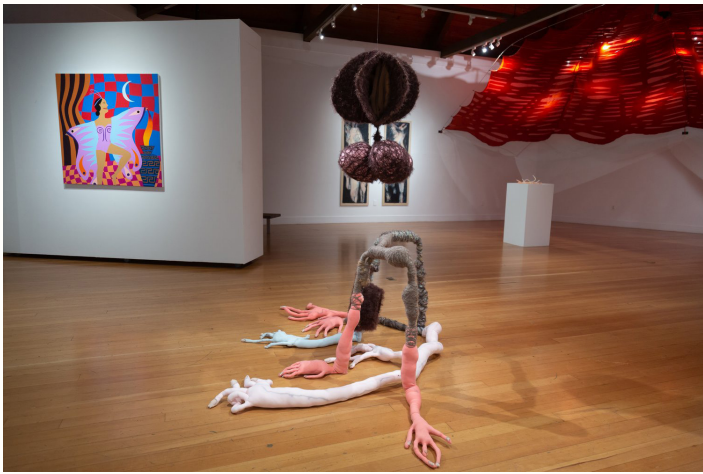
Exhibition view, Photo by Carla Hernandez