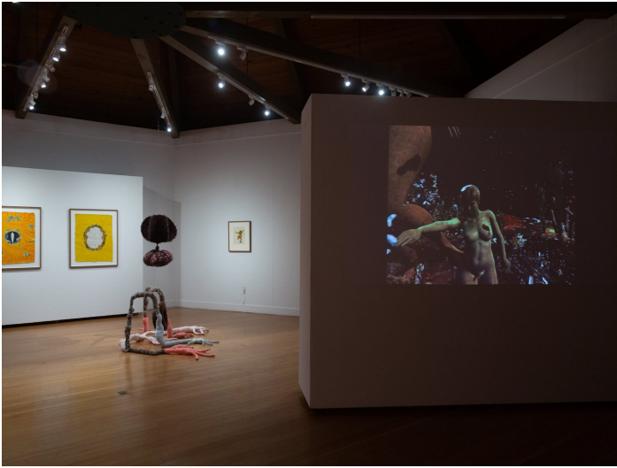
Exhibition view, Photo by Carla Hernandez