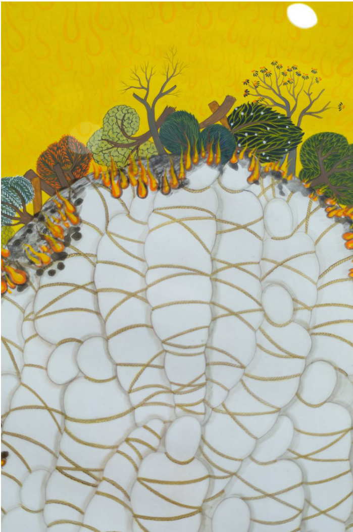
Painting by Rupy C. Tut (detail)