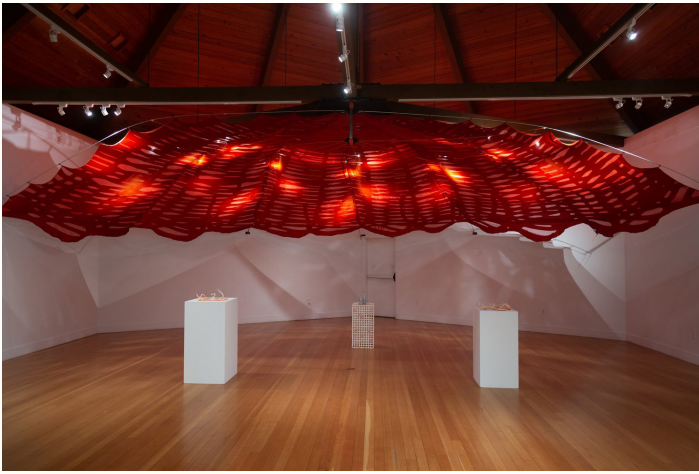
Exhibition view, Photo by Carla Hernandez