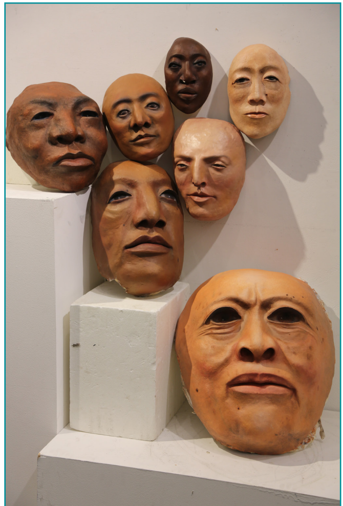
Kin , 2021, oil paint on paper mache clay, full installation 5'x5'8"

This body of work evolved from the tiny faces I've been making since I was a little girl as a response to my affinity for portraiture. In early 2020 I experimented with making life-sized faces and felt deeply compelled to continue, despite being unsure of what it all meant. With each new face, the work would evolve and change, each piece re-contextualizing the last one. As I began showing the work, people told me how they were seeing the faces of their loved ones. It was then that I began to understand