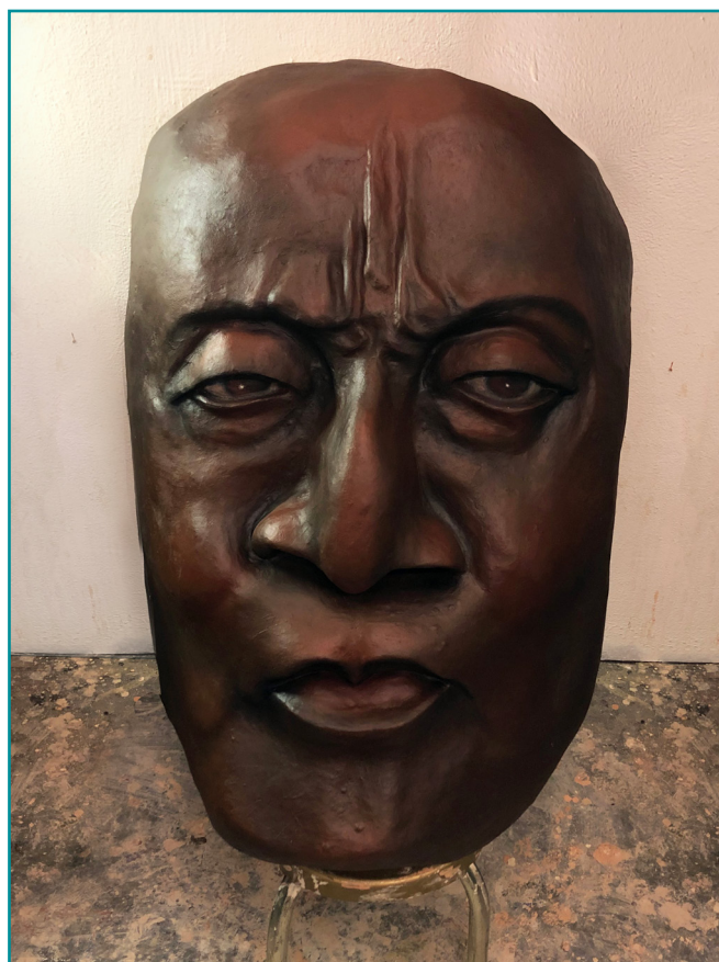
kin no.13, 2021, oil paint on paper mache clay, 40"

Work as hard as I possibly can, make as much work as I can. Work with communities to establish new models for education rooted in the arts and principles of DEIB (diversity, equity, inclusion, and belonging). Make friends with people who are good with money, or else get rich and establish endowments, and foundations for the arts. Have some children, have a wonderful life, and die—eventually.