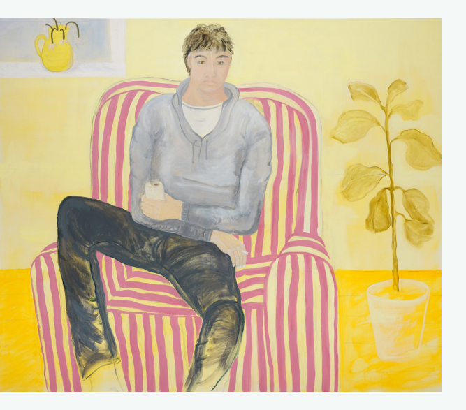
Uncertain Futures (Mo), 2022, acrylic and oil on canvas, 60 x 72"

transformative potential, animated by hues that evoke the mutable nature of our spirits.