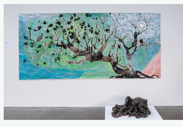
the last perch, infested with splendor (memory of a future fossil), 2022 watercolor, acrylic, walnut ink, graphite, found paper, glitter, chain, velvet and thread on paper and glazed ceramic sculpture, 56 x 120"; 11 x 21 x 29"

Liz Lis's staple color is a shade of green that I have seen them use throughout their work, and even in their hair. The color is discretely present in their recent installation, the last perch infested with splendor (memory of a future fossil), 2022. On a large (60" x 120") painted and collaged paper support, they have rendered a background of emerald green, sapphire blue, and a touch of coral pink that extends like an expressionistic map, a vague geography and ocean. On top of this, there is a textural photographic collage in brown and black, which describes a visceral tree rising and quirkily narrowing into slender branches. Though wintery and skeletal, the tree has green and red velvet leaves stitched in gold and harbors a selection of cut-out