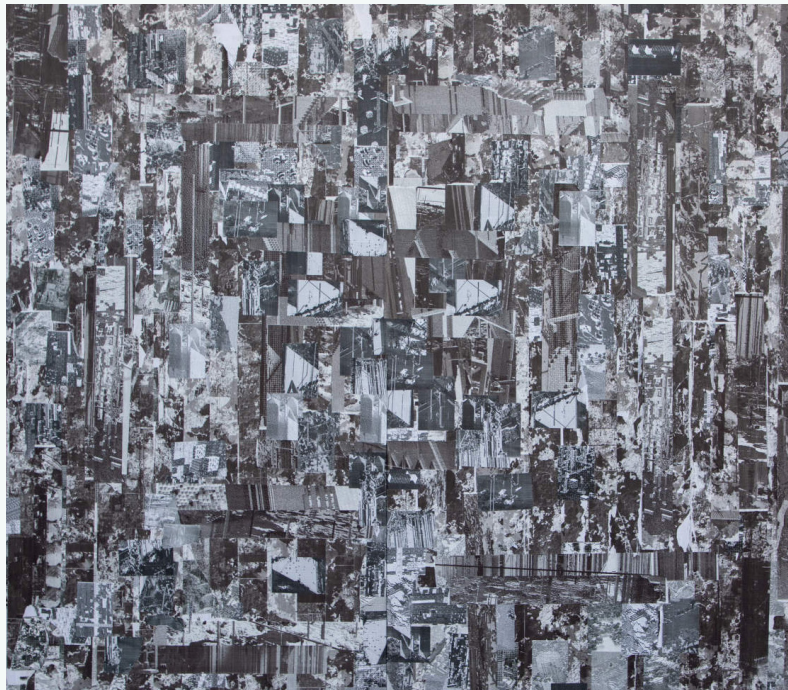
Joel Lithgow, 2b2t, 2022 - 8' x 8' - Thermal receipt paper & label stickers

The second showing will be in May, at BOOK/SHOP Gallery on Broadway in Oakland. We are planning to alter the images that make up the piece while keeping the structural elements the same.