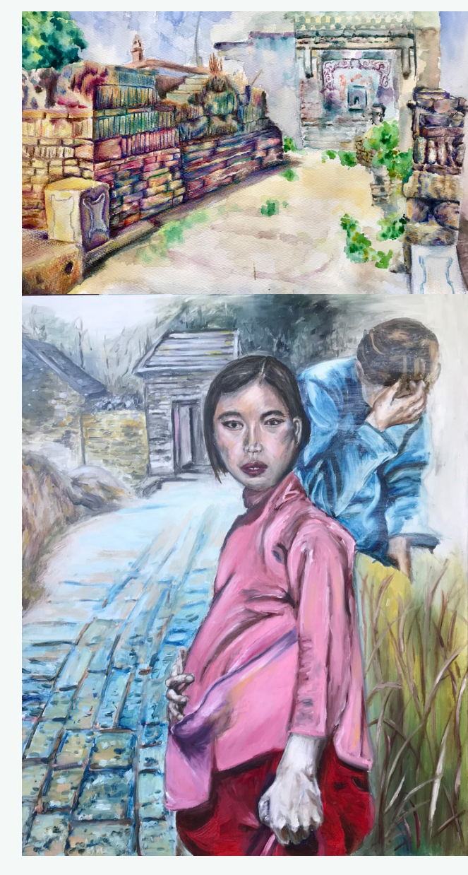
(1) Amy F. Zheng, Where do I come from 我是谁/Childhood Memories, 2021, watercolor and colored pencil on watercolor paper, 15 x 25 inches (2) Amy F. Zheng, Mom with Kids series, 2021, oil on canvas, 30 x 24 inches each

With no ink outlines or clean borders, Zheng's watercolor forms blend into a dreamscape. Certain details come into focus, like rainbow bricks in the wall on the left, while others recede into an airy wash. Her positive associations with the space have quite literally colored her perception of it. Zheng paints foliage in bright emerald, sunlit stone in happy yellow, and shadows in vivid blues and magentas. It reads just like a memory – impressionistic and imperfect, capturing the essence of how it felt to stand there, bare toes wiggling in the dirt.